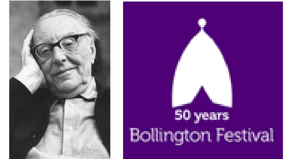
Carl Orff (1895-1982) / Bollington Festival 2014

With soloists , pianists and percussionists from the Royal Northern College of Music, Orff's unique piece captures brilliantly all the energy, beauty and often bawdy humour of the medieval lyrics.