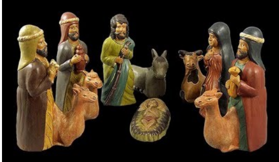
Quecha Peruvian Indian soapstone carving

¡Ay Andar! , the exuberant piece that opens our Christmas concert, exhorts us to travel to Bethlehem to see the Christ Child. It's by Juan de Araujo, a Spanish baroque composer who travelled to South America and absorbed the influences of native music. Motets, carols and instrumental music from the UK, Iberia, N and S America are sure to delight.