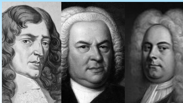
Charpentier / J S Bach / Handel