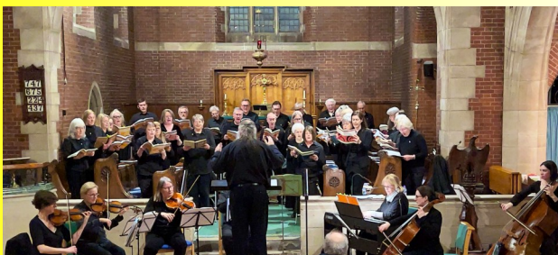
BFC at St Oswald's March 2023.

Tickets £10: 01625 511881 Booking essential!