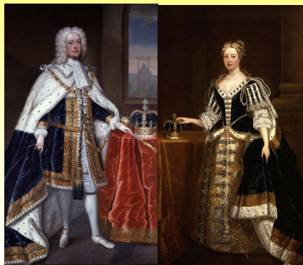
Charles Jervas: King George II and Queen Caroline